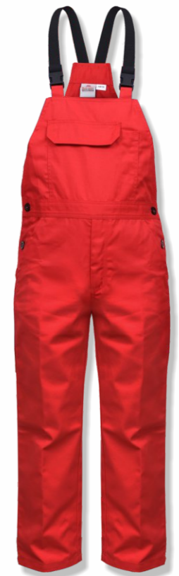
Easy Action Bib-Pants