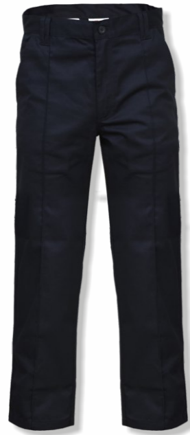
Smart Mens Trousers