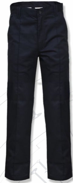
Smart Ladies Trousers