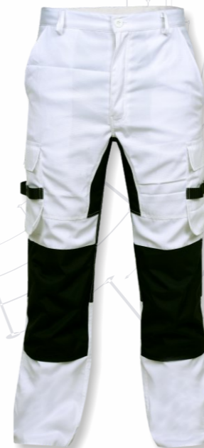
Car Painter Trousers